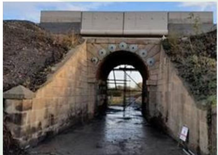
Rebuilt underpass along the Northumberland Line