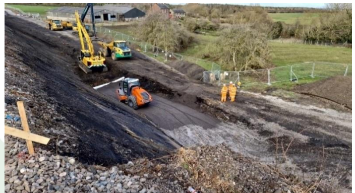
Embankment works south of Newsham