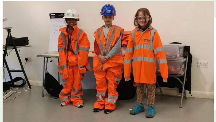
Attendees at the STEM Club Workshop