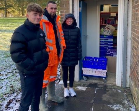
Morgan Sindall employees donating to Wansbeck Valley Food Bank