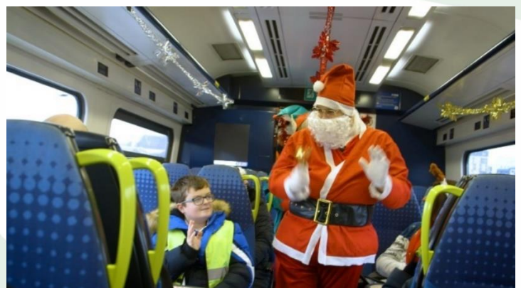
Local children on the Santa Special Service with Santa