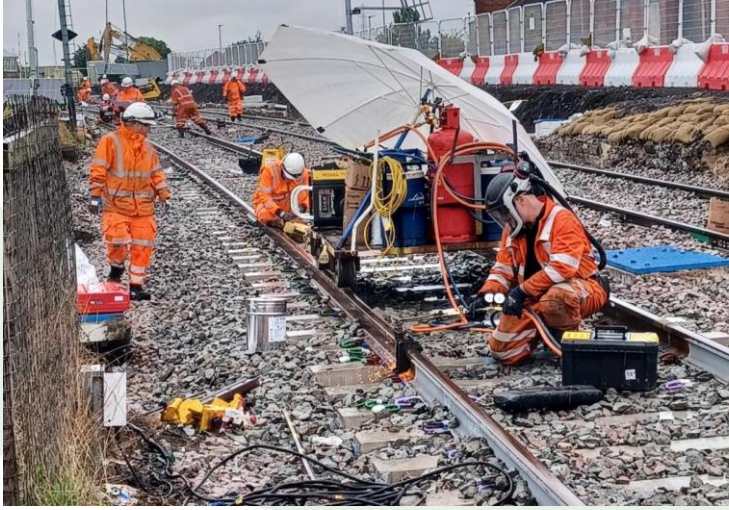
Track works at Bedlington Station