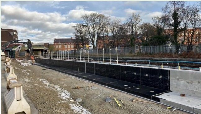
Platform installation at Ashington