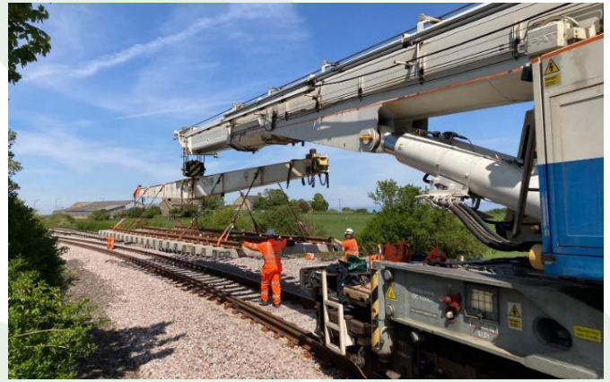
Track renewal works