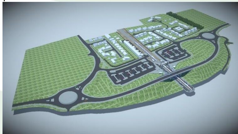
Artist's impressions of the Newsham station

The completed station construction will see the diversion of the A1061 over a new road bridge and the closure of the existing level crossing. A pedestrian footbridge will also be built to allow travellers to access both platforms.