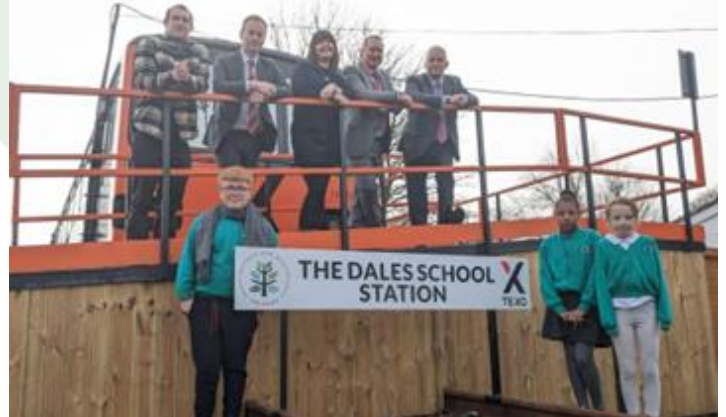
Pupils from the Dales School and the Northumberland Line project team