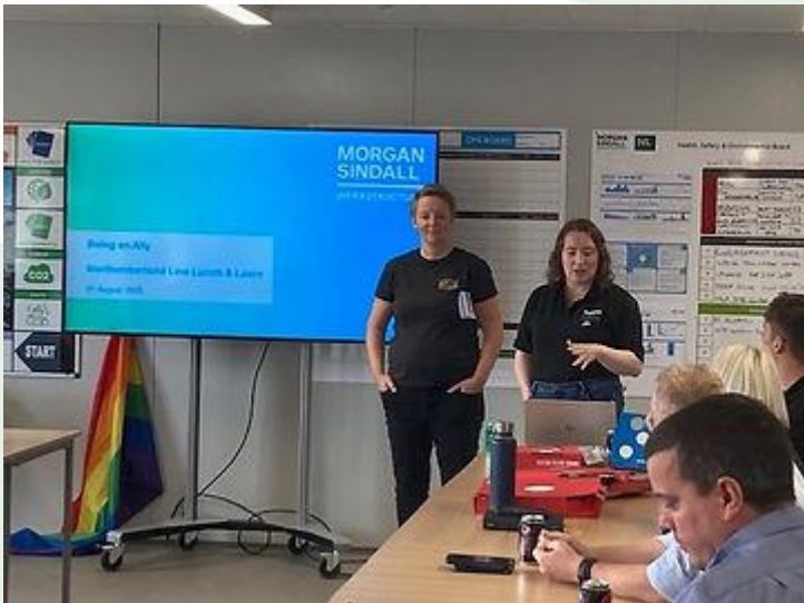
"Being an Ally" toolbox talk held to support LGBTQ construction delivered to principal contractor Morgan Sindall Infrastructure.

Welcome to the September 2023 edition of the Northumberland Line newsletter. The aim of this newsletter is to give an overview of upcoming site work, as well as letting you know about key project milestones.