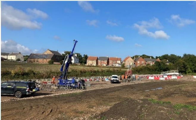
Mining remediation works at Seaton Delaval