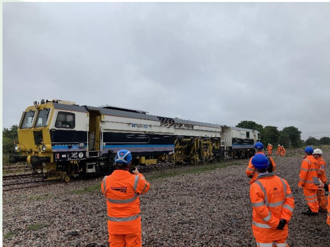
Track works being completed at Ashington

The journalists saw sparks fly as welding and grinding teams applied the finishing touches to the recently laid track. The visitors also saw two tampers rolling slowly along the line and were able to capture close-up footage of the machines in action.