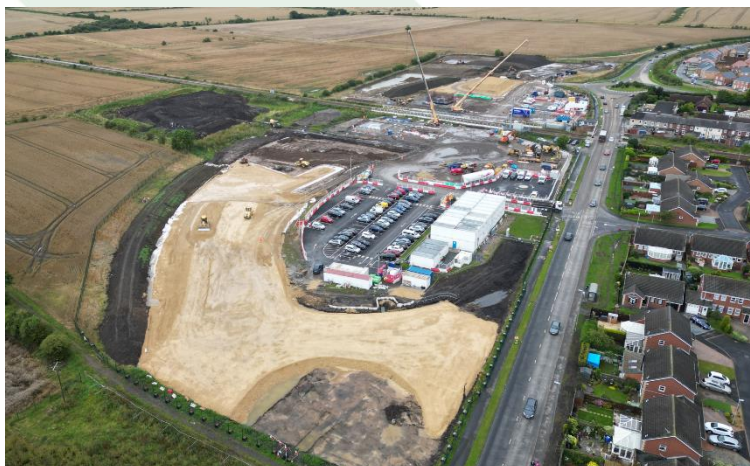
Aerial view of Newsham station site

Work is progressing for the construction of the new road bridge and roundabout off the A1061 South Newsham Road, which will require temporary traffic management to be in place (see below for more details).