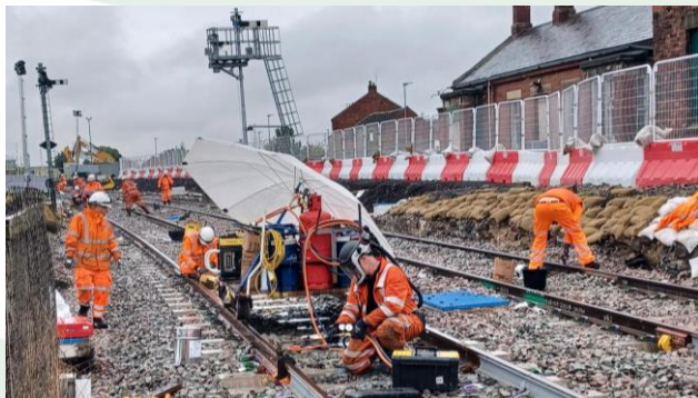
Network Rail completing track renewal works

The teams have worked around the clock to replace around 400m of track at Bedlington Station and 100m of track at West Sleekburn, through the Marchey's House level crossing.