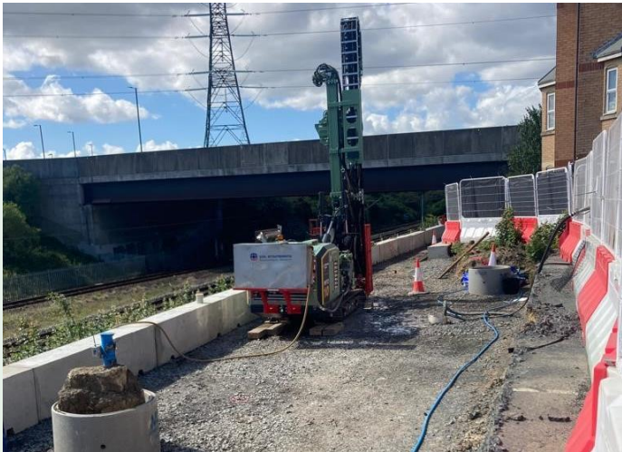
Mining remediation works at the site of Northumberland Park Station

Works to enable the start of mining remediation, which will ensure the voids left by historic mining are completely filled in, have now commenced. The mining remediation works are then expected to take between three and six months to complete.