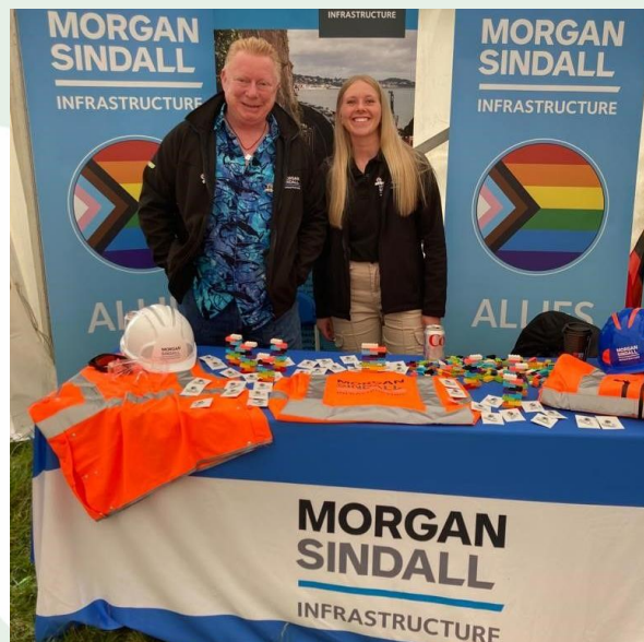
Morgan Sindall Infrastructure team's stall at the Northern Pride 2023 event

Over the weekend of 22 and 23 July, the team from Morgan Sindall Infrastructure were proud to support the Northern Pride festival, which took place in Newcastle, sponsoring the Family and Youth Zone. Despite the (very!) wet weather, the event attracted over 15,000 participants.