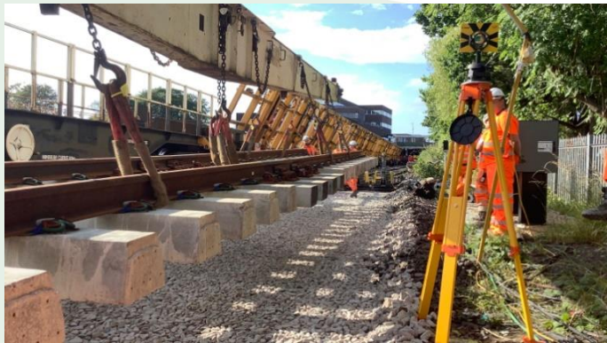
Network Rail track renewal works in Ashington

Welcome to the August 2023 edition of the Northumberland Line newsletter. The aim of this newsletter is to give an overview of upcoming site work, as well as letting you know about key project milestones.