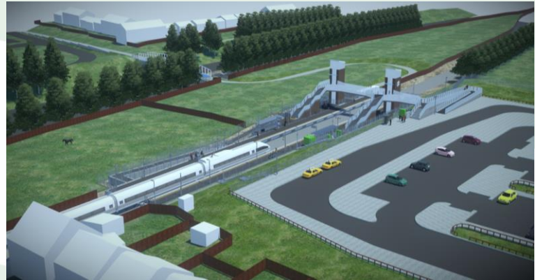
Artist's impression of Blyth Bebside Station and A189 footbridge

We look forward to sharing the progress of the station and footbridge construction works in future newsletters.