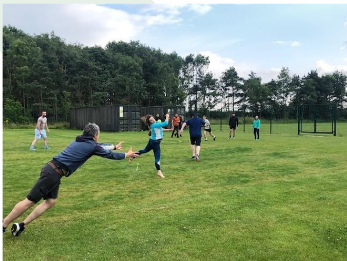
Action shot from the Northumberland Line rounders tournament

You can find out more information about the work of the Lighthouse Charity here https://www.lighthouseclub.org/ .