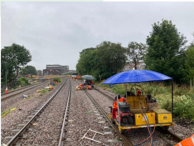
Track renewal works in progress in Ashington