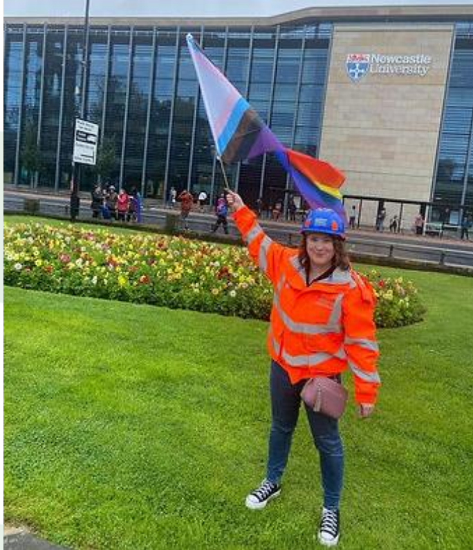
Flying the flag at Northern Pride