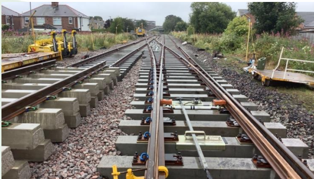
New track in place at Ashington

Hospital Level Crossing (the foot crossing between Roseneath Court & Darnley Road) has also now closed.