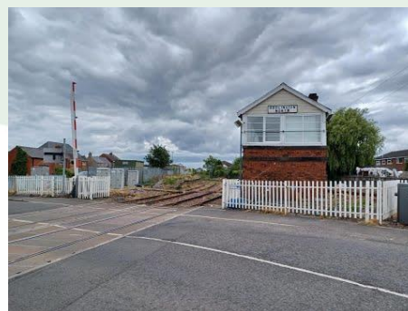
Interview with driver and VIP passengers

Please play the videos below to hear from the driver of the special service, share the passenger experience, and the view from the driver's cab.