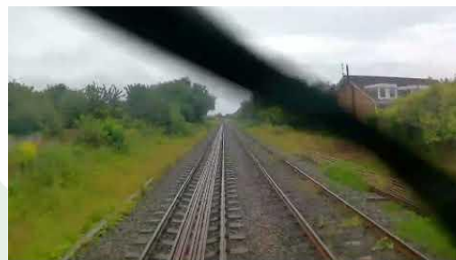
Journey along the Northumberland Line from the driver's cab