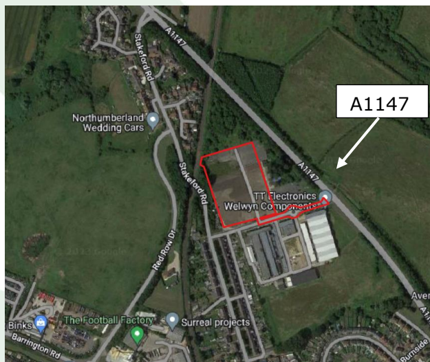
Location of temporary work site north of Bedlington (Google Maps Imagery @2023 CNES/Airbus, Getmapping plc, Infoterra Ltd & Bluesky. Maxar Technologies, Map data @2023).

Works are due to start soon on a temporary compound to the west of the A19, near the Northumberland Park Station site. Residents living nearby will have received notifications in advance of the works to set up this compound.