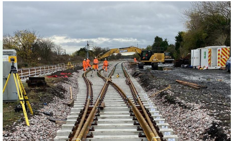
New tracks being installed for the Northumberland Line.

Works to bring the disused railway sidings at Furnace Way, to the south of Bedlington, are also progressing well, with new tracks now installed. Construction works for a new maintenance yard have also recently started.