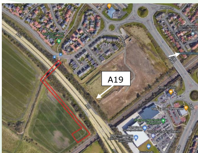
Location of site compound near Northumberland Park station site (Google Maps Imagery @2023 CNES/Airbus, Getmapping plc, Infoterra Ltd & Bluesky. Maxar Technologies, Map data @2023).