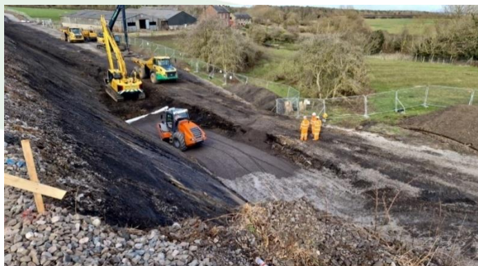
Earthworks taking place at Newsham.

Works to re-shape the existing embankments on a section of railway track between New Hartley and Newsham are progressing well. The works are required to support the upgrade of the track to enable it to carry passenger services.