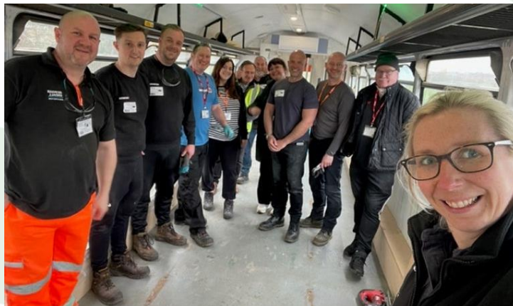
Volunteers working on the conversion of a Pacer train at the Dales School.