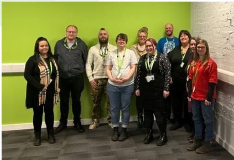
Attendees at the Mental Health First Aid training