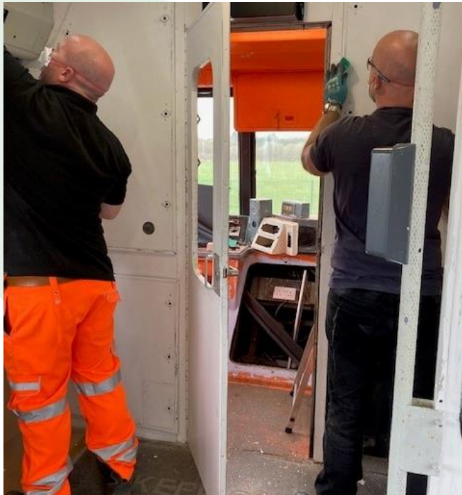
Volunteers working on the Pacer train at the Dales School.

Work has now started on the second carriage, and will see it transformed into a science, technology, engineering and maths (STEM) classroom. Our Northumberland Line project team were keen to lend a hand, and in March they took a break from their day jobs to help with the works to clear the train ahead of its conversion.