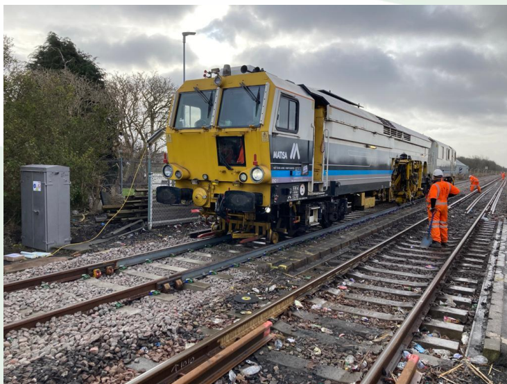
The team working to install new tracks on the line leading into Ashington Station.

Welcome to the April 2023 edition of the Northumberland Line newsletter. The aim of this newsletter is to give an overview of upcoming site work, as well as letting you know about key project milestones.