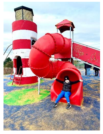
We appointed Wicksteed Leisure to deliver the new play area at Milburn Park which opened in April 2023. This £150,000 project included a contribution of £50,000 from Northumberland County Council, and £30,000 generously donated by two local landowners.

Needles Eye removed and returned to grass. The fencing from the old site was recycled and used in Milburn Park play area. The design included an eye catching 5m high lighthouse multi play unit that can be seen from across our beautiful bay. It was hoped it would attract families to walk the length of the bay to explore our town and encourage tourists from the nearby caravan park and it appears to be